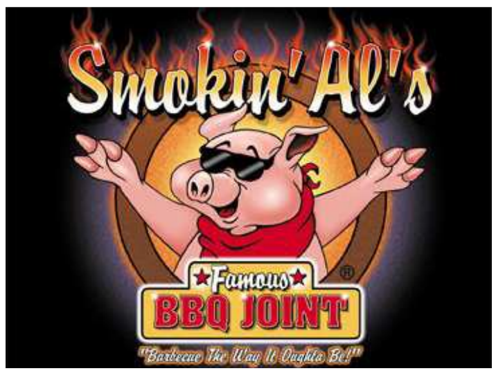
Al Horowitz, Founder of Smokin' Al's Famous BBQ Joint, September 7 th – 13 th