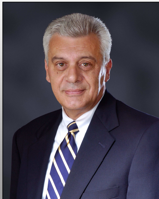
Town of Oyster Bay Campaign Coverage through ELECTION DAY