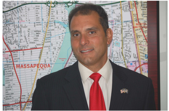
Joseph Saladino, NYS Assemblyman October 27 th – November 2 nd