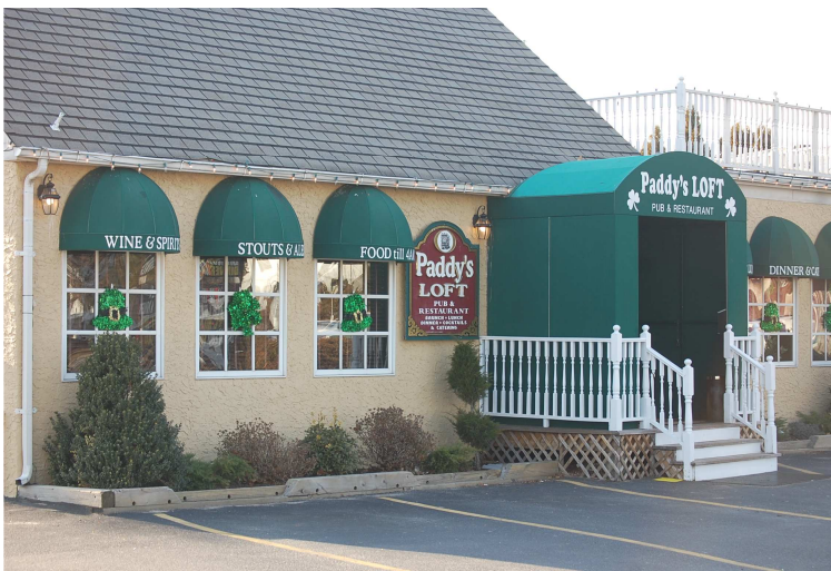
Paddy's Loft Pub & Restaurant Offers a Great Meal, Music & Drinks in a Pleasant Environment March 15 th -21 st