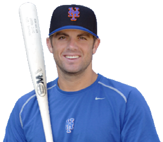
Baseball Season Begins with L.I. Picture Frame & Art Gallery's Autographed Memorabilia March 22 nd - 28 th