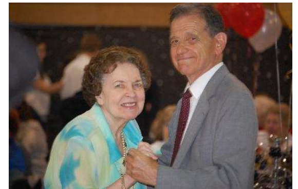
Massapequa High School Hosts Senior Citizen Prom