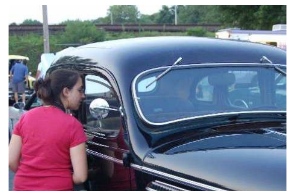
Classic Cruise Night Sponsored by the Town of Oyster Bay, Friday Evenings at the Train Station