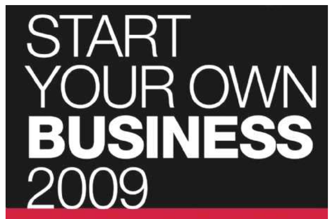
Take Control of Your Future April 26 th – May 2 nd